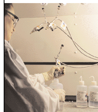
Dispensing within the hood area with just the push of a lever is safe and convenient.