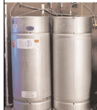
Pipes are installed to run from the containers to each laboratory. One container can feed several laboratories.